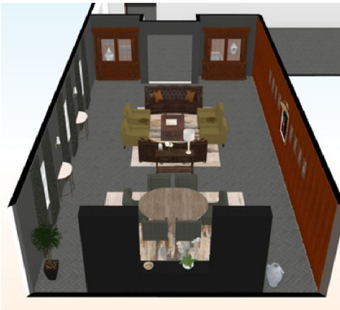
New reception and meeting room!

The ramp and automatic doors the Foundation sponsored two years ago make entering the Frost Building easier and accessing this new space convenient for our guests. 🌸