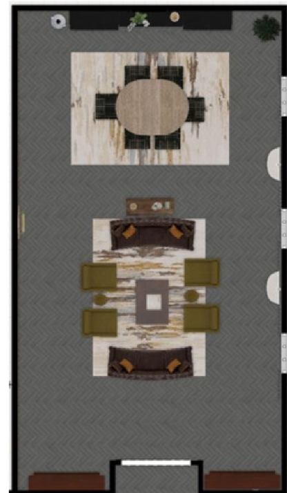
New reception and meeting room - top view.